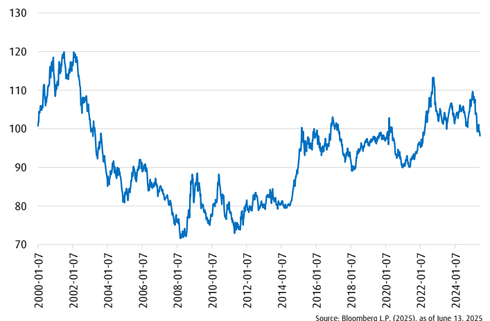
Chart 2: U.S. Dollar Index

While several reasons can help explain this recent depreciation, it's important to note that the USD had actually been trending up since the Global Financial Crisis of 2008-09 and peaked during the inflation scare of 2022. During this time, the greenback gained about 60% (chart 2).